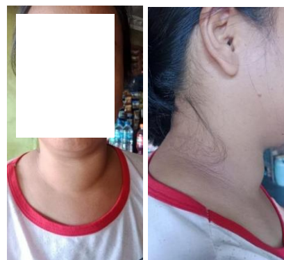
Figure 1. Goiter

On cytologic examination of aspirate samples, cystic colloid goiter was found. Based on the results of history and examination, the patient was diagnosed with HT with Grave's Disease, also diagnosed as Hashitoxicosis. On the next visit on April 16, 2024, the patient was given Levothyroxine 1x100mg therapy for a month, then on April 18, an anti-TPO and TSH Receptor Antibodies (TRAB) examination was carried out with the results of anti-TPO >1000 IU/mL and On TRAB On 2.46 IU/L. On April 23, TSH and FT4 were re-checked with TSH 0.65 uIU/mL and FT4 86.20 ng/dL. On May 17, TSH 5.97 uIU/mL and FT4 1.34 ng/dL. On June 20, TSH 7.41 uIU/mL and FT4 1.06 ng/dL.