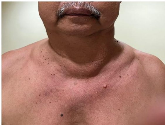
Figure 1. Clinical photo of the patient before treatment

Based on the history and physical examination, the patient had clinical symptoms of Riedel's thyroiditis, so further examination was carried out. Patients underwent laboratory investigations, radiological and histopathological examinations.