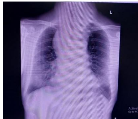
Figure 3. Photo of the patient's chest

Soft tissue density is seen in the colli region bilaterally which has entered the superior thoracic aperture. Soft tissue density in the paratracheal area is well defined, the edges are regular, form an obtuse angle to the lungs, and a is within clean houte sign to the ascending aorta. The heart normal CTR, dilated aorta. Both sinuses and diaphragm are good, and bones are intact. From this examinations, we found bilateral soft tissue masses in the neck a superior mediastinal mass presumed to be a thymoma, and aortic dilatation.