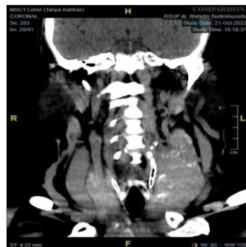
Figure 4. MSCT of the patient's neck