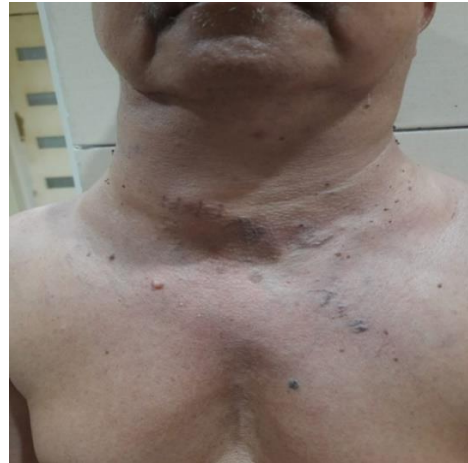
Figure 2. Clinical photos of the patient after treatment with methylprednisolone and tamoxifen

Soft tissue density is seen in the colli region bilaterally which has entered the superior thoracic aperture. Soft tissue density in the paratracheal area is well defined, the edges are regular, form an obtuse angle to the lungs, and a is within clean houte sign to the ascending aorta. The heart normal CTR, dilated aorta. Both sinuses and diaphragm are good, and bones are intact. From this examinations, we found bilateral soft tissue masses in the neck a superior mediastinal mass presumed to be a thymoma, and aortic dilatation.