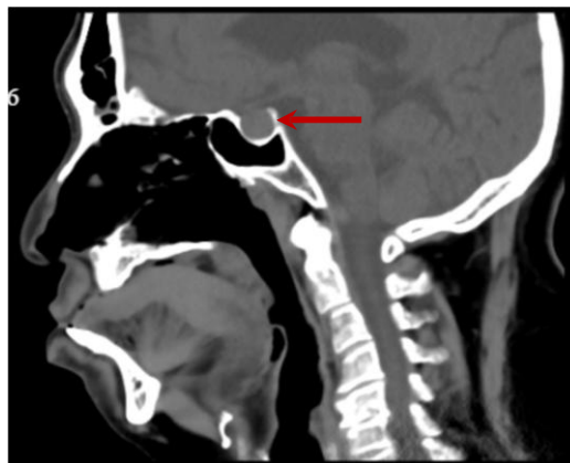
Figure 2. CT scan shows a pituitary adenoma (red arrow).